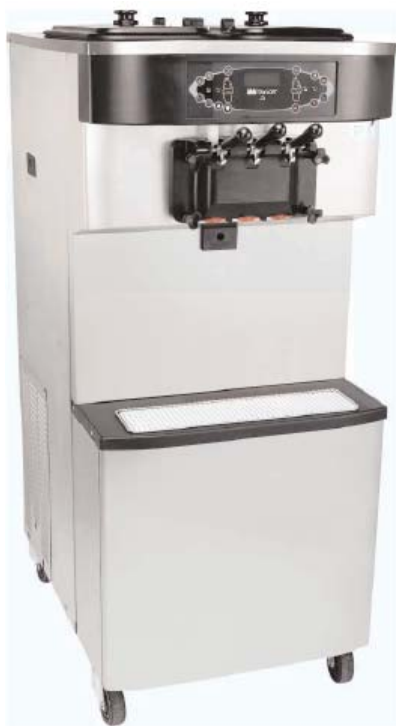
C712 & C713